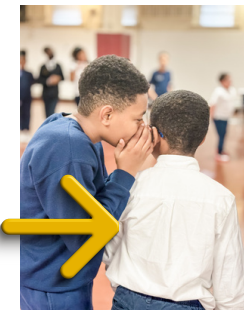
The “Telephone Game” demonstrated the importance of great communication skills