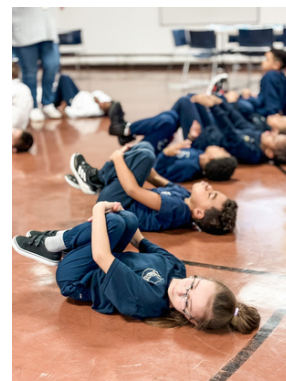
Breathing exercises and meditation practice